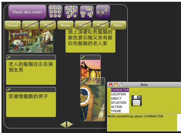
Fig.2. A snapshot of the user interface.